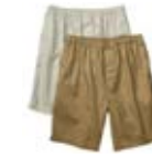
Elastic or Drawstring