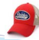
Non Golf Logo Caps